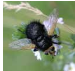
Giant Tachinid Fly