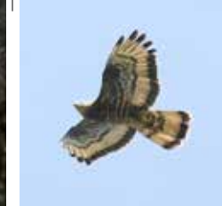
European Honey Buzzard