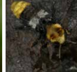
Emus hirtus/Rove Beetle