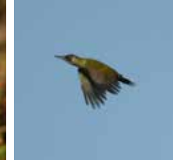
European Green Woodpecker